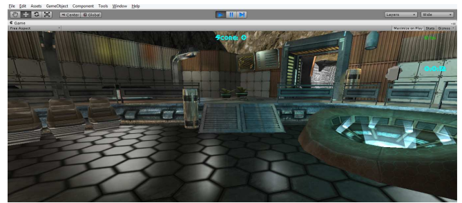
Fig. 3. Score of the game

The shorter the time it takes between the acquisitions of two objects, the greater the score. If the delay is less than one minute, one hundred points are acquired, if it is between one and two minutes, fifty points are acquired, if the delay exceeds two minutes, twenty-five points will be obtained regardless of time spent. Figure 3 shows the score of game.